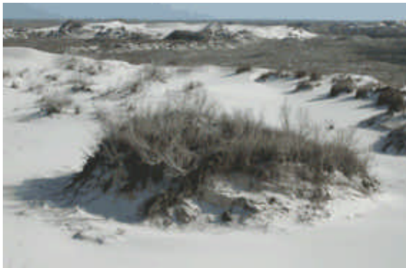
Padre Island, which was part of Rosa María Hinojosa de Ballí family holdings

Carving out a role as a one of the first female ranchers in Texas